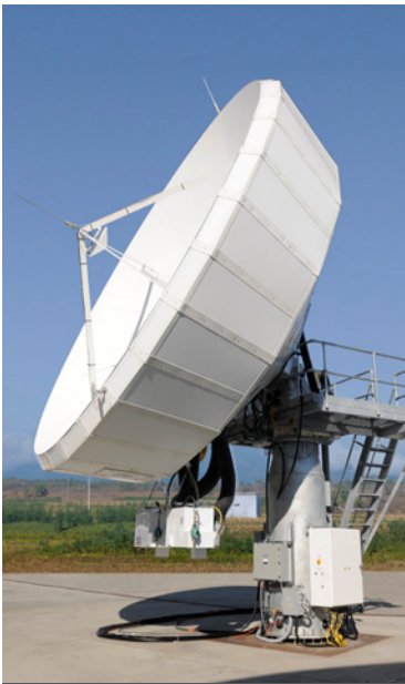
KA BAND GATEWAY ANTENNA