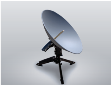
PRO PORTABLE TERMINAL