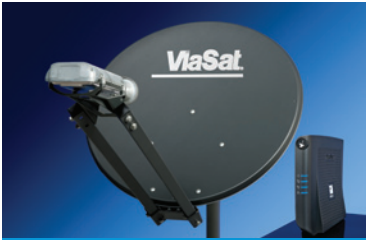
RESIDENTIAL USER TERMINAL